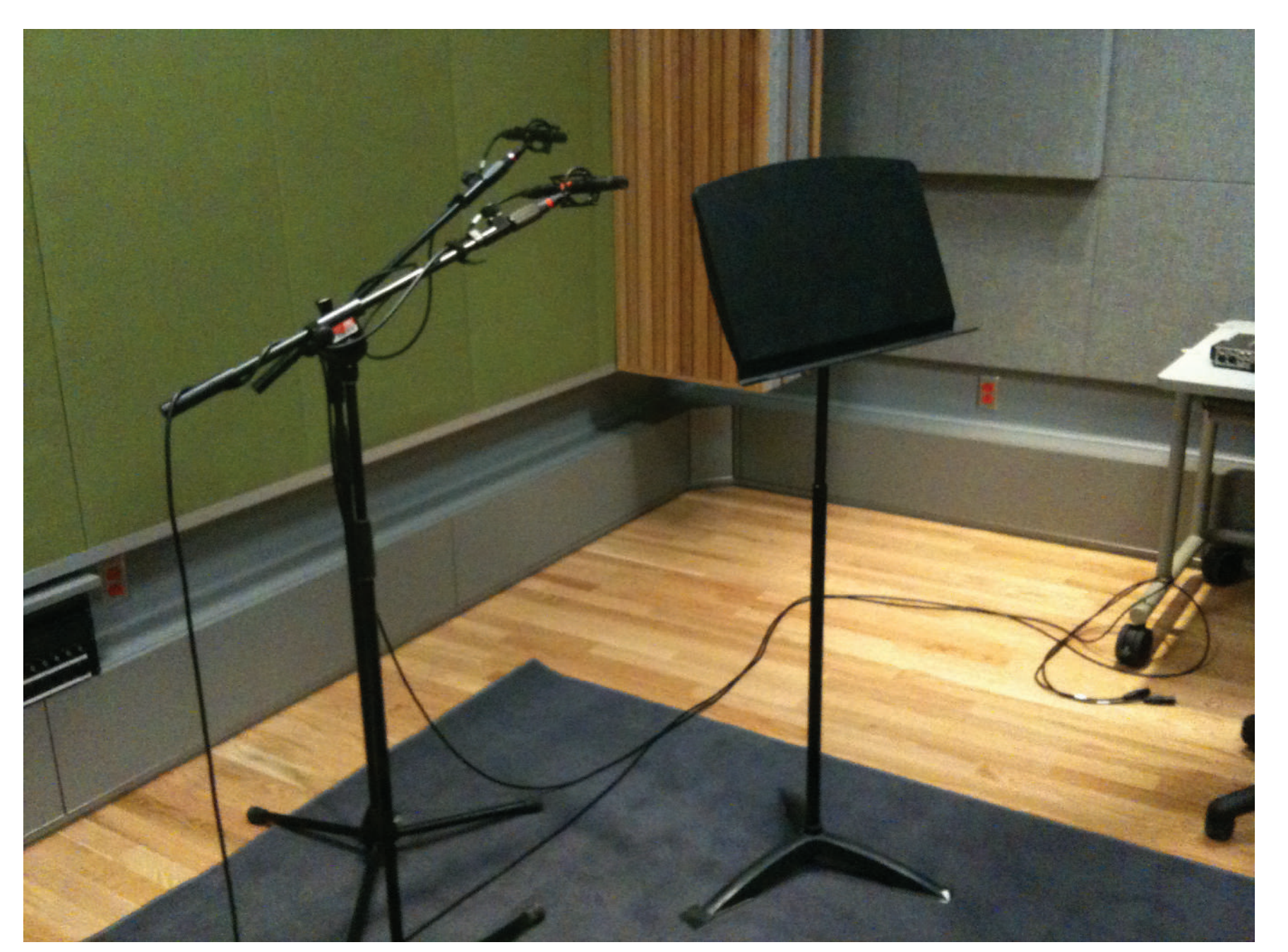
The recording setup

The goal of this study was to examine the possibility of training a classifier to determine good from bad tone quality. It is a first step to determining if computers could give automatic feedback to student musicians regarding their tone quality. It also serves to create a labelled data set that could be used to research audio features indicative of tone quality.